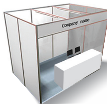
Example of stand area

For further information and stand availability please contact Andrew Osborne, andyos@globalcommoditiesgroup.com Tel: +44 (0) 208 892 4821