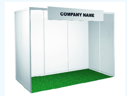
Example of stand area

For further information and stand availability please contact Andrew Osborne, andyos@globalcommoditiesgroup.com Tel: +44 (0) 208 892 4821